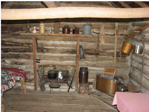
Little House on the Prairie (reconstruction)