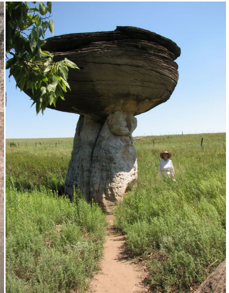
Mushroom Rock State Park