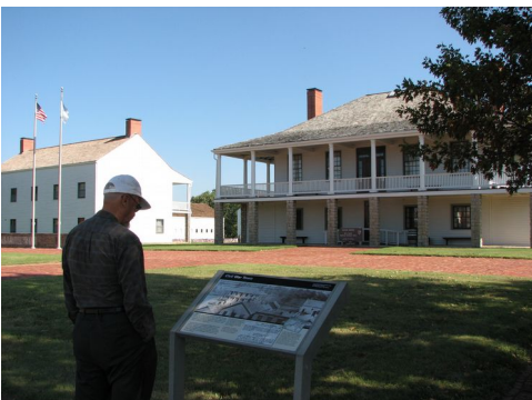
Fort Scott Kansas

We had a lot of fun on those trips; there is a lot to see in and near Kansas!