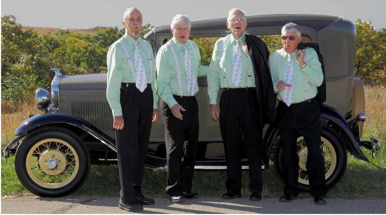
The Apple Core Tet