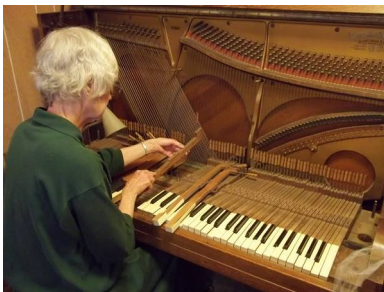
last time piano was opened